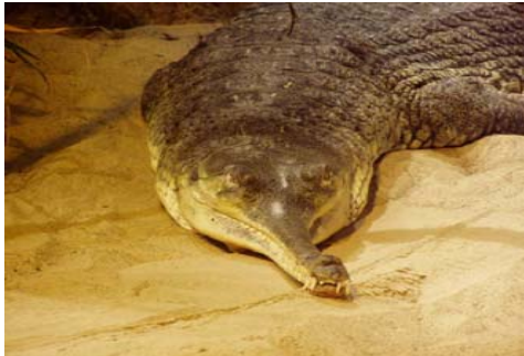
Cleveland Metroparks Zoo