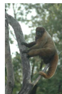
Cincinnati Zoo & Botanical Garden