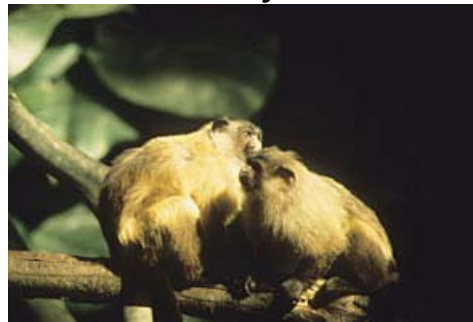
Roy Fontaine, Wisconsin Primate Center Library