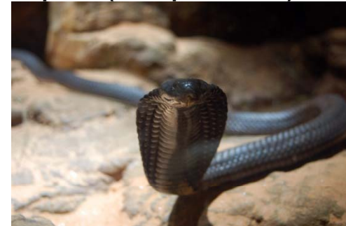
Virginia Aquarium & Marine Science Center