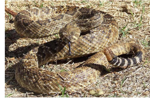
U.S. National Park Service