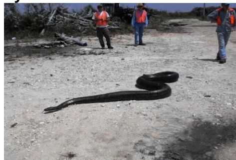
U.S. Geological Survey