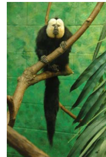
Cincinnati Zoo & Botanical Garden