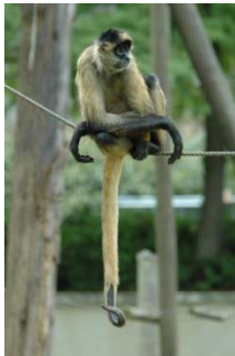
Cincinnati Zoo & Botanical Garden