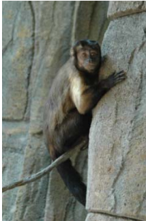
Cincinnati Zoo & Botanical Garden