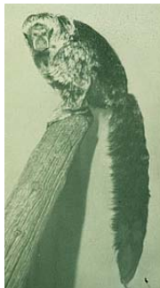
Zoological Society of Philadelphia, Wisconsin Primate Center Library