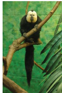
Cincinnati Zoo & Botanical Garden