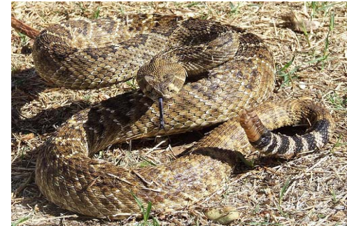
U.S. National Park Service