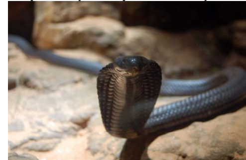
Virginia Aquarium & Marine Science Center