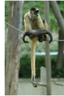
Cincinnati Zoo & Botanical Garden