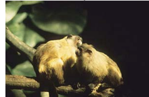
Roy Fontaine, Wisconsin Primate Center Library