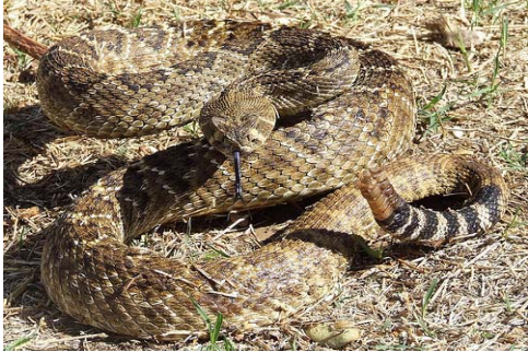
U.S. National Park Service