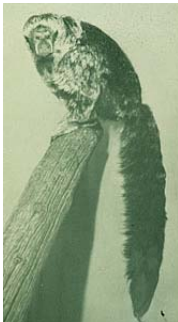
Zoological Society of Philadelphia, Wisconsin Primate Center Library