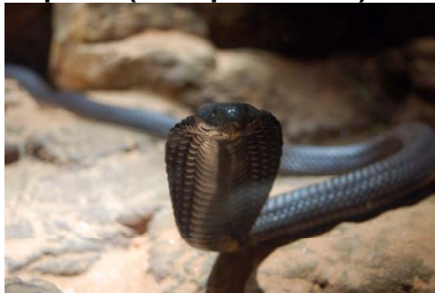
Virginia Aquarium & Marine Science Center