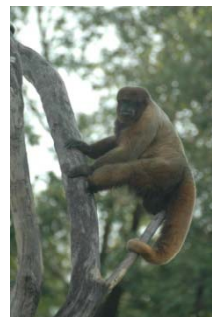
Cincinnati Zoo & Botanical Garden