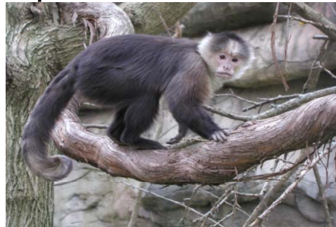
Dickerson Park Zoo