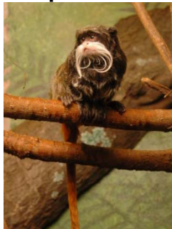
Cincinnati Zoo & Botanical Garden