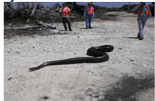
U.S. Geological Survey