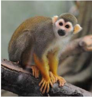
Pueblo Zoo, Pueblo, CO