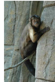
Cincinnati Zoo & Botanical Garden