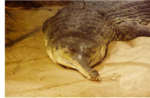
Cleveland Metroparks Zoo