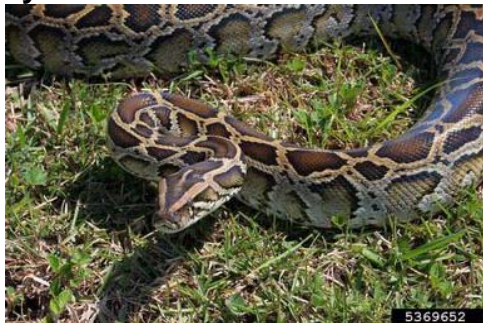
Skip Snow, National Park Service, Bugwood.org