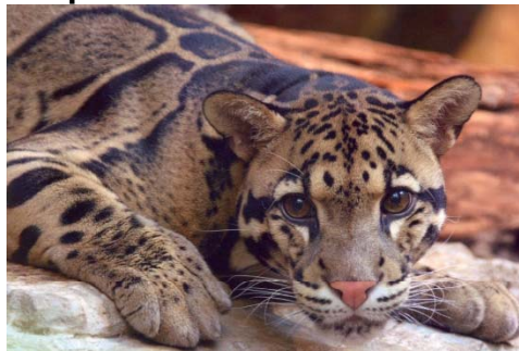
Cleveland Metroparks Zoo