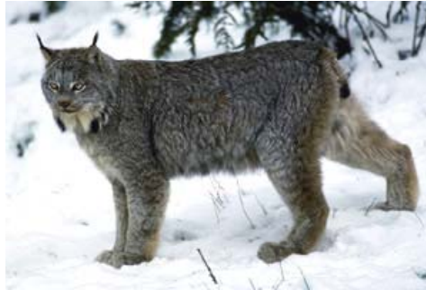
U.S. Fish and Wildlife Service