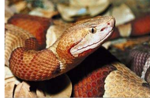
U.S. National Park Service