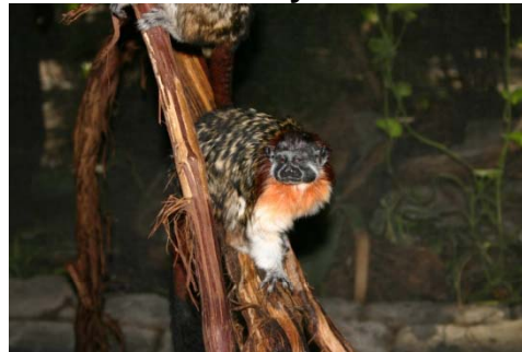
Cleveland Metroparks Zoo