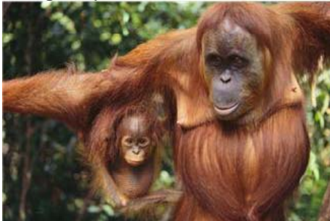
Microsoft Clip Art