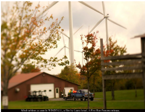
Wind turbines as seen in WINDFALL, a film by Laura Israel. A First Run Pictures release.