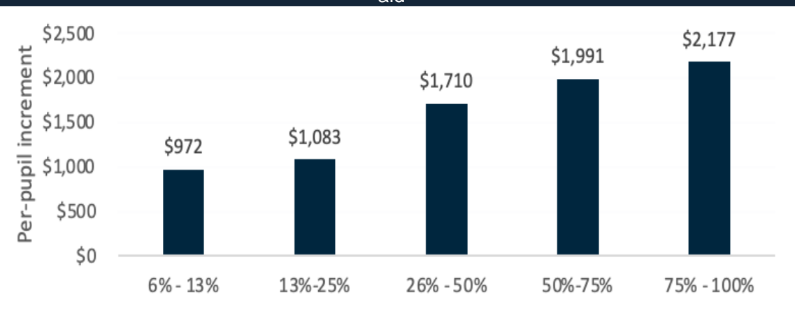
Share of Black and brown students in the student body

Source: Policy Matters Ohio based on Source: Policy Matters Ohio based on "Traditional School District Per-Pupil Formula Aid Estimates, H.B. 305 Substitute Bill (L-0626-6), without Phase-ins, FY 2021," linked in "Revised K-12 Funding Bill Boosts Money For Poor Districts," Gongwer-Ohio, November 6, 2020. And data on demographics of school districts on the website of the Ohio Department of Education