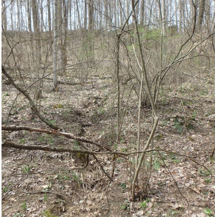
PHOTO 1 – This erosion gully is a common type of unnatural land feature that qualifies as an ephemeral stream. This particular erosion gully is in hillside woods that have been logged historically two times. These types of features are extensive through the hilly terrain of eastern and southern Ohio. Ohio EPA requires that these erosion gullies be replaced or mitigated at an exorbitant cost (as much as $650 per foot), if impacted.