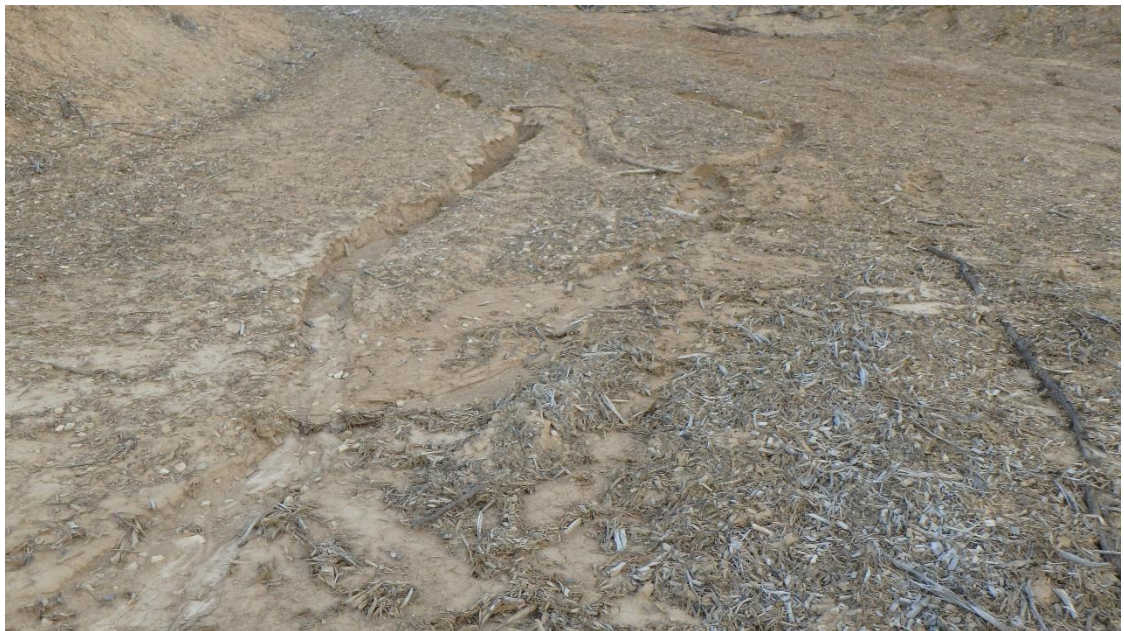
PHOTO 2 – Erosion gullies developed in short access road to a field. These erosion gullies have a cumulative length of about 600 feet and flow into a small road ditch with intermittent flow. Ohio EPA's new General Permit requirements effective June 2020 would apply to mitigate the filling of these ephemeral streams at an exorbitant cost (as much as $650 per foot).