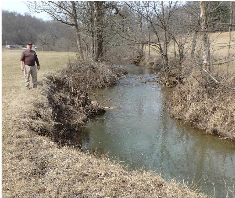
PHOTO 5 – This perennial stream is what most folks would consider a stream as opposed to the ephemeral streams pictured in PHOTOS 1, 2, 3 and 4.