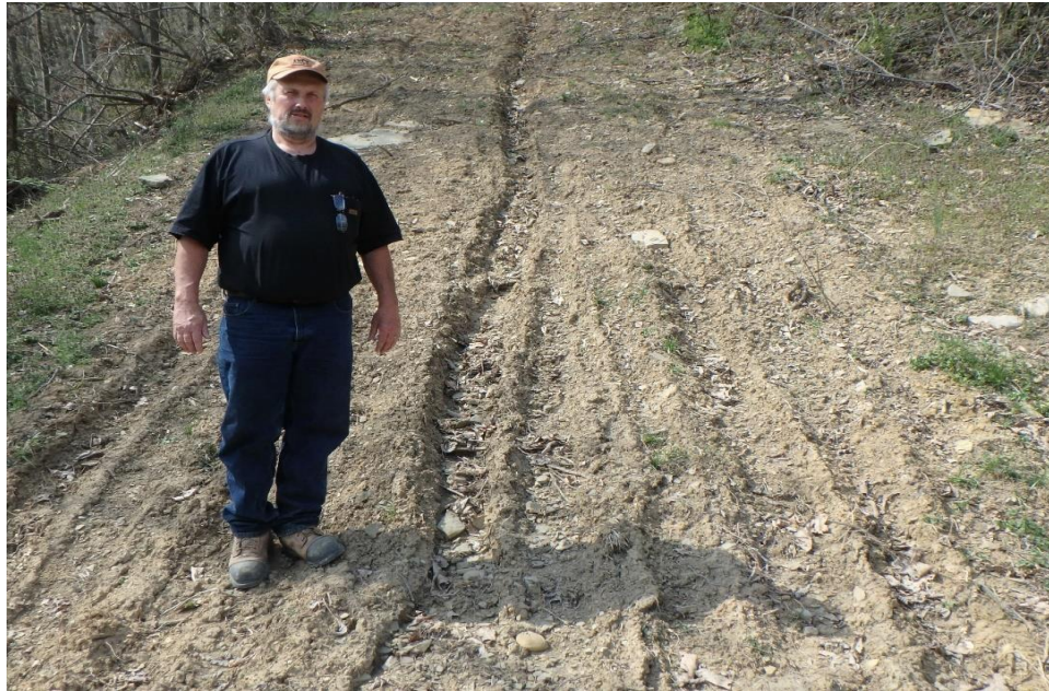
PHOTO 3 – Erosion gully developed in a 4-wheeler trail that fords a perennial stream. This erosion gully is about 350 feet in length. Ohio EPA’s new General Permit requirements effective June 2020 would apply to mitigate the filling of this ephemeral stream at an exorbitant cost (as much as $650 per foot).