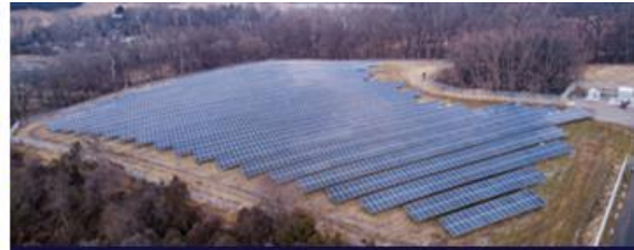
Mill Road - 18 MW