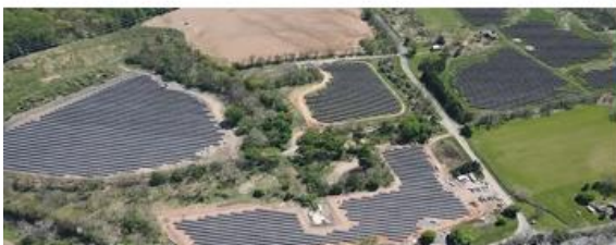
Holland - 18 MW