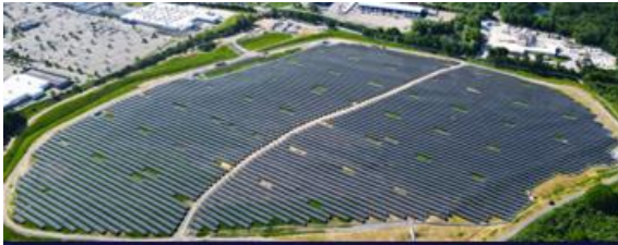
Mt. Olive – 25.6 MW