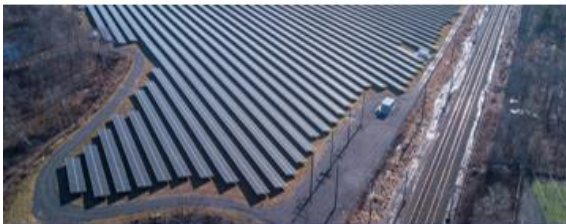
Old Bridge - 10.7 MW