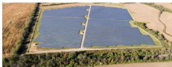
Greenwich - 9.5 MW