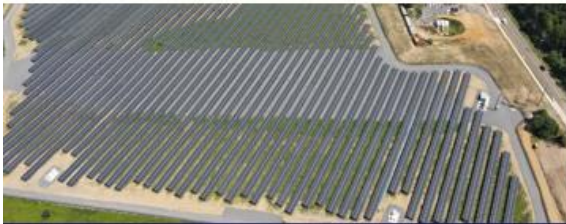
Monroe - 14.7 MW