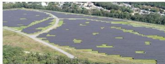
BEMS - 10 MW