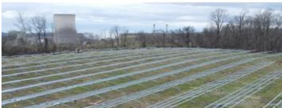
Foul Rift - 19 MW Under Construction