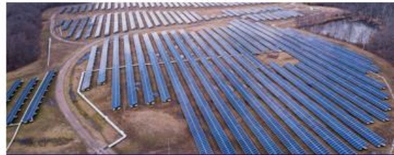
South Brunswick - 13 MW