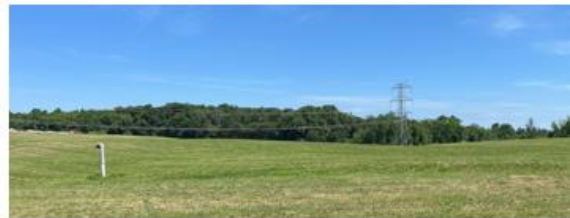
Parker Road - 18 MW Construction 2024

CEP Examples of Solar Projects on Landfills and Brownfields.