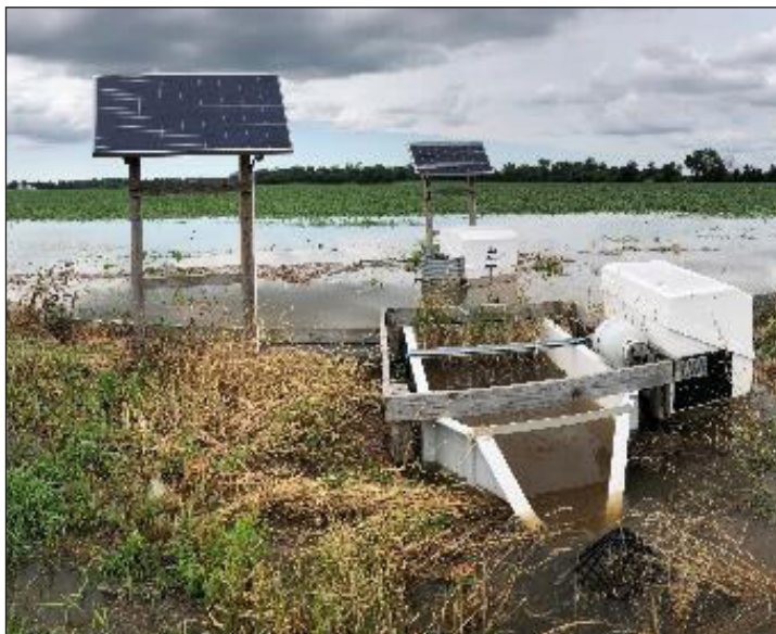
Edge-of-field monitoring and drainage.

As new methods evolve in the agriculture industry, the H2Ohio team strives to be a leader in conservation efforts. An exciting advancement in 2022 was the announcement of funding for the construction of two-stage ditches across 24 counties in the H2Ohio project area.