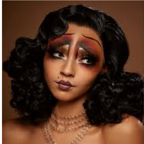
A makeup artist who popped up when I googled "art makeup" Oh,