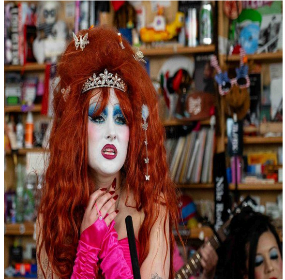
Chappell Roan, singer

I actually don't know if this is a drag artist or a character impersonator.