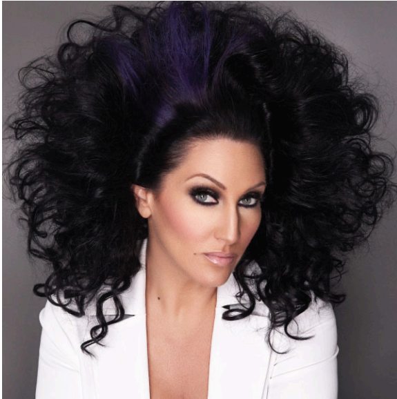
Michelle Visage, singer + TV personality

Remember how I said those were SOME examples of drag performers? Not all of them. Some of those pictures were of drag performers, and others were makeup artists, models, singers, etc. See how you can't always tell? Here, let me help you out.