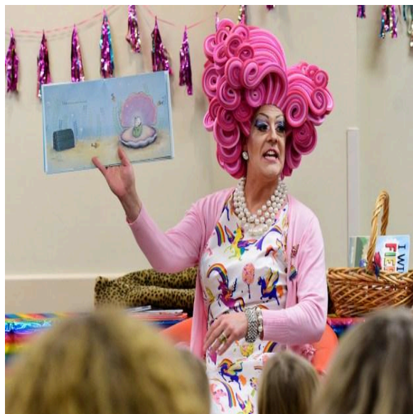
A drag artist reading a book