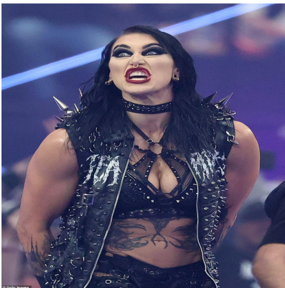
Rhea Ripley, WWE Wrestler