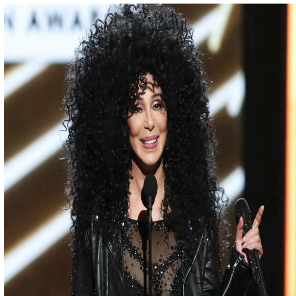
The actual singer Cher