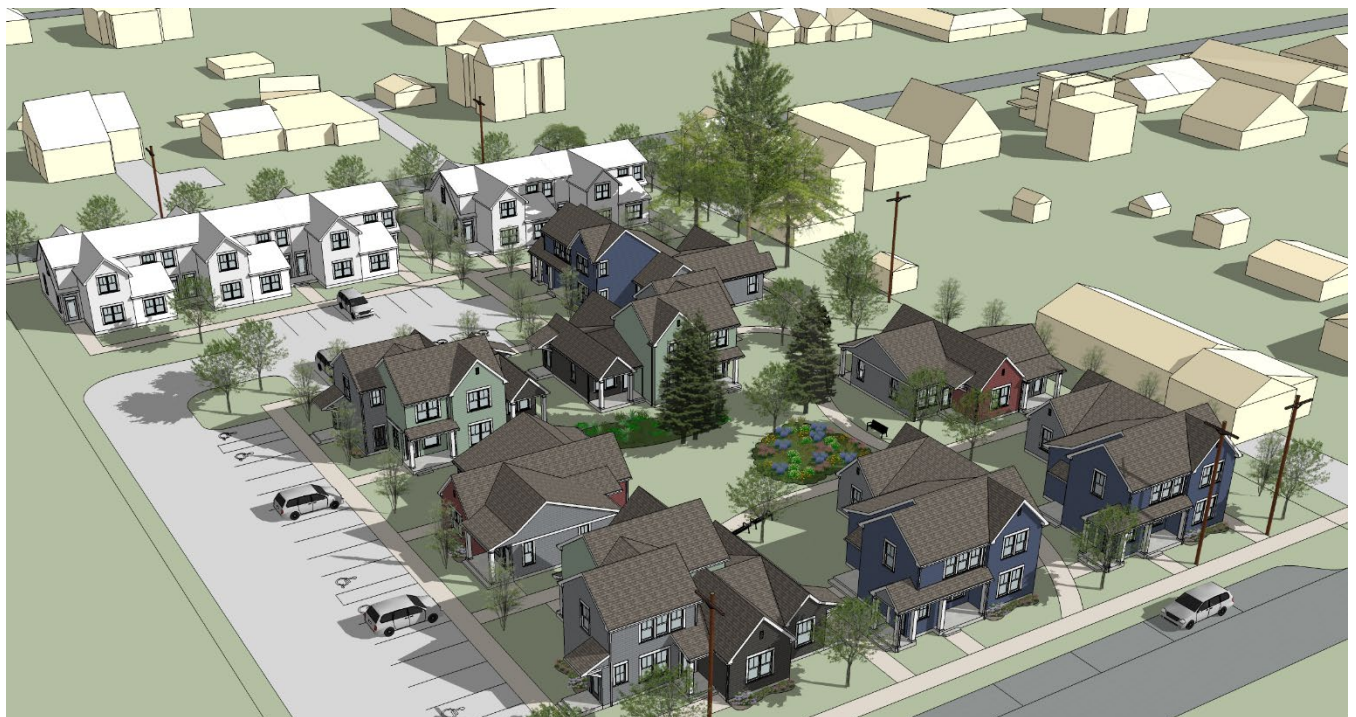
Photos and Renderings of The Cascades project, being built in four phases. Phase 1 (eight units) is slated for completion this summer.