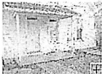
REQUEST TO BUY THIS PHOTO

Here behind a vacant house at 1452 Myrtle Ave. in North Linden, a 13-year-old girl was raped while she was waiting for a school bus, police say.