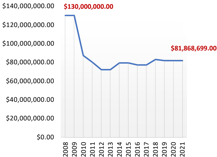
Line Items 600521 & 655522