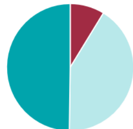
200% FPL – ELIGIBLE $43,440.00 annual income ($20.88/hour)

■ Child Care Costs $3,803.80 ■ Other Living Costs $18,016.32 ■ Remaining Expendable Annual Income $21,619.88