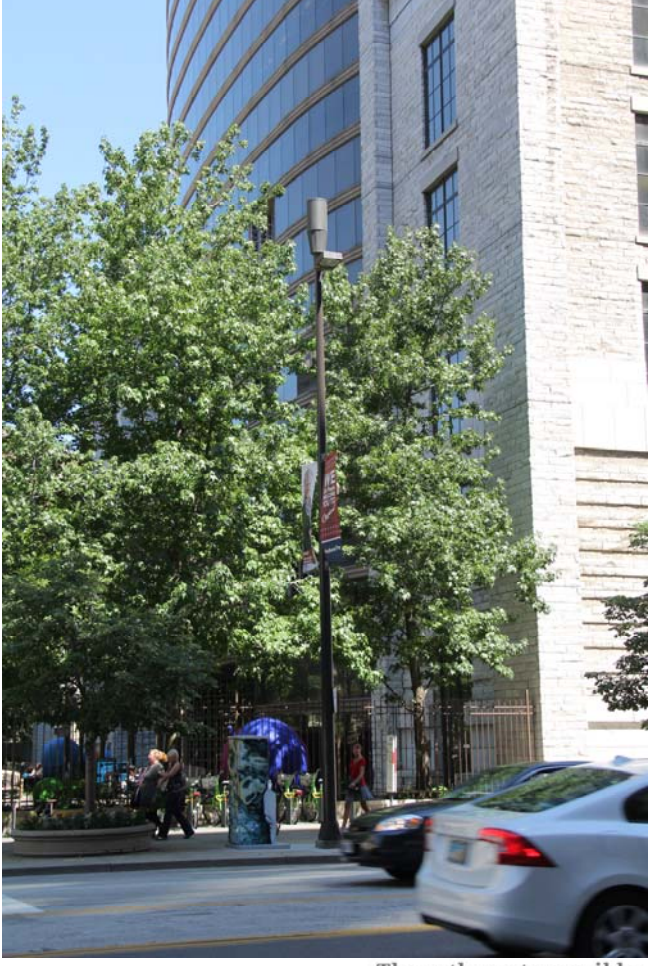
The pathway to possible. CrownCastle.com