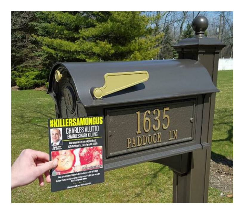
Example of postcards sent to neighbors of Dayton area doctors

Picture posted by Created Equal on Social Media of postcard delivery in the neighborhood of Stericycle CEO.