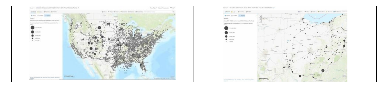
Figure 1. Critical Infrastructure map of the United States and Ohio weighted by CO<sub>2</sub> emissions.

However, as I already mentioned the Appalachian Storage Hub is fueling new proposals by the month, whether it is Marathon's proposed underground NGL storage facility in Hopedale or its completion of its Rio Pipeline expansion aimed at moving Utica NGLs from Lima, Ohio, to Robinson, Illinois. The primary foci of this bill seem to be the types of mega infrastructure being proposed right in Senator Hoagland's backyard with the largest example being the PTT Cracker that seems a fait accompli at this point even thought countless residents have voiced their opposition or at the very least deep skepticism as to the benefits of such a project (Figure 2).