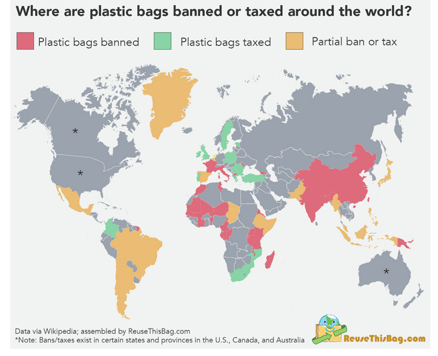
(note: not updated to reflect EU ban or pending Canadian ban)

To join these efforts would place Ohio proactively, proudly, and positively on the right side of history, helping to combat the local and global environmental crises of plastics and micro-plastics contamination.