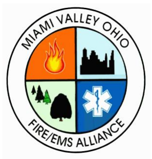
March 9, 2021

House Finance Committee Ohio State Representative 77 South High Street Columbus, Ohio 43215