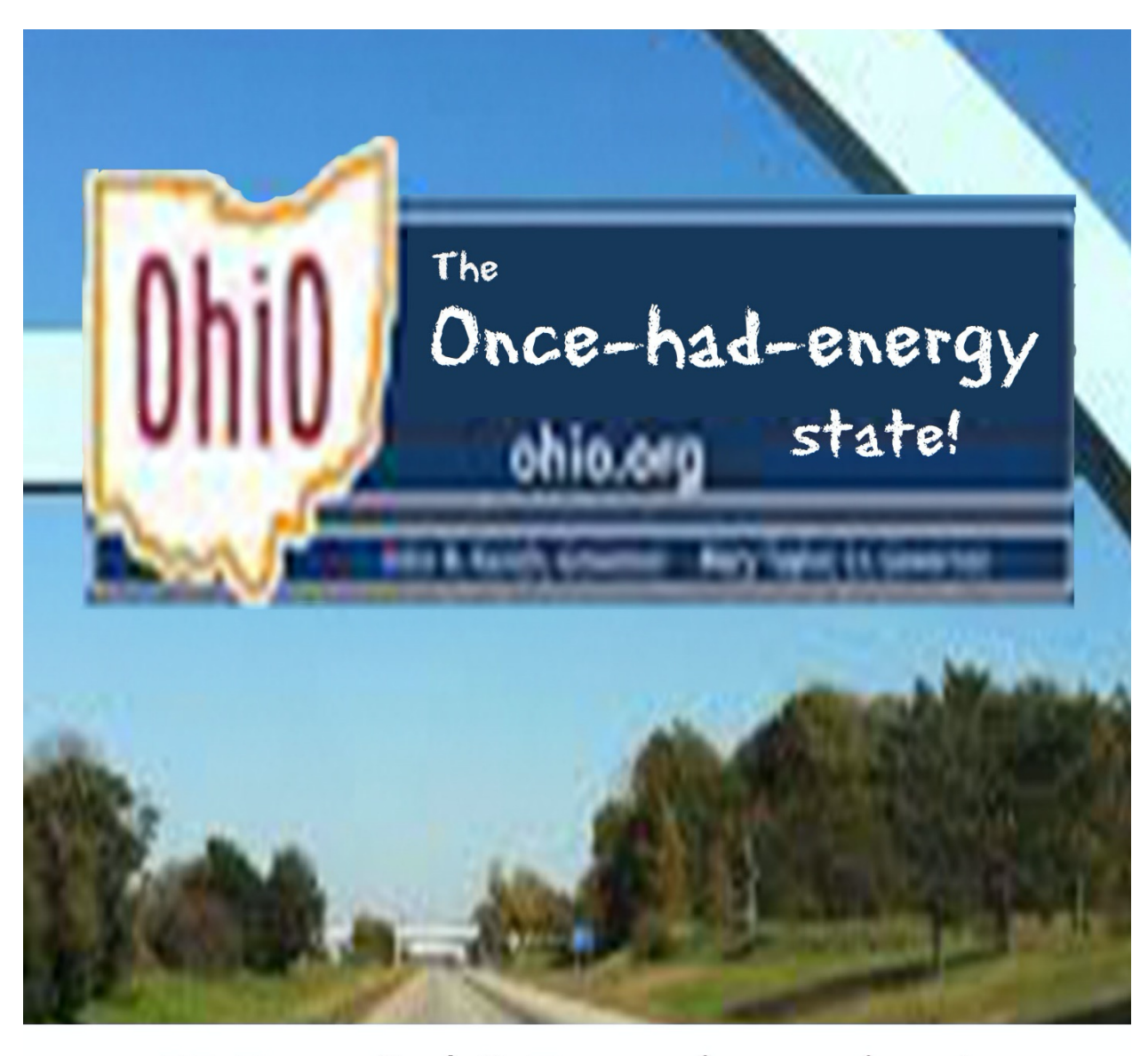
H.B. 118 / S.B. 52 in action!