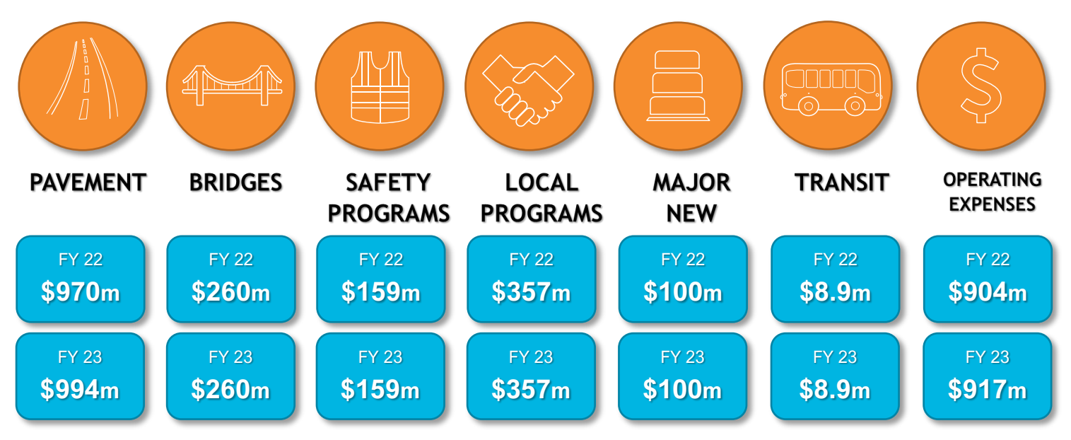
Table 4: Anticipated FY 22-23 ODOT budget expenditures

This proposal will allow ODOT to continue to take care of all planned highway maintenance and preservation work. We will also continue to fund our highway safety and local programs at pre-pandemic levels.