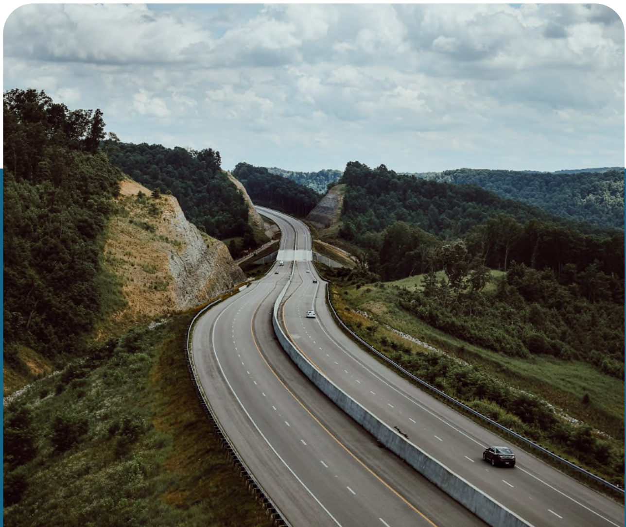
Cover photo of the Southern Ohio Veterans Memorial Highway Ohio State Route 823.