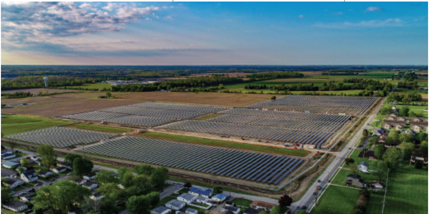
Piqua Manier Solar in Miami County

For more information, please visit NextEraEnergyResources.com