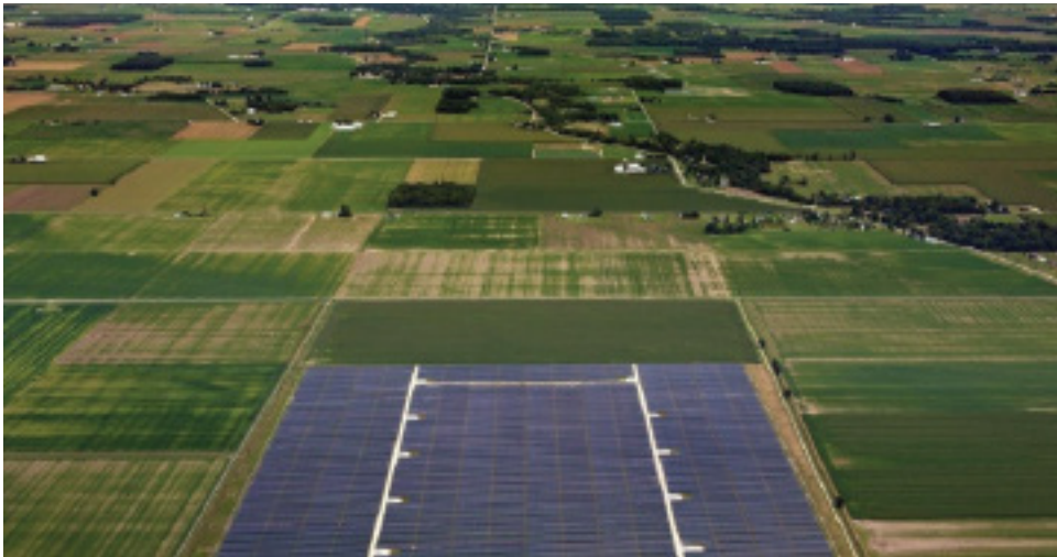
Bowling Green Solar in Wood County